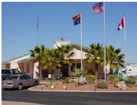
At Cochise Terrace RV Resort, Benson, AZ