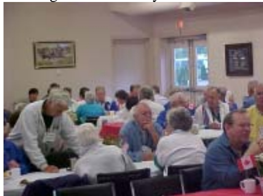
We're Always Talking or Eating