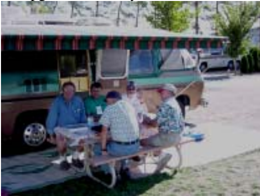
Talking Things Over at the Fishers' Coach