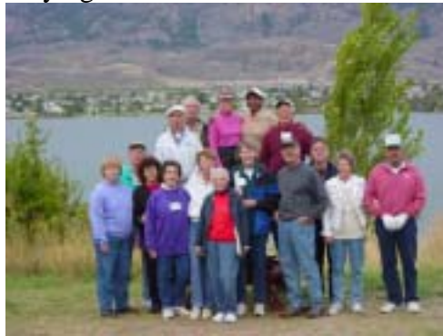
Walkers' View from the Winery