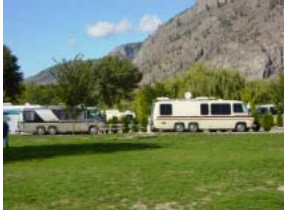
Campground Scenery #2