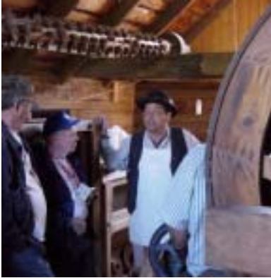
Inside the Gristmill