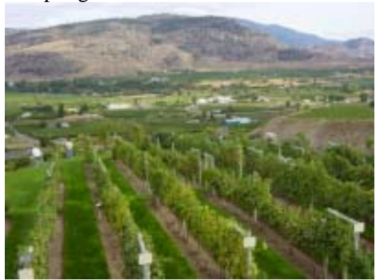
Looking Over the Vineyards