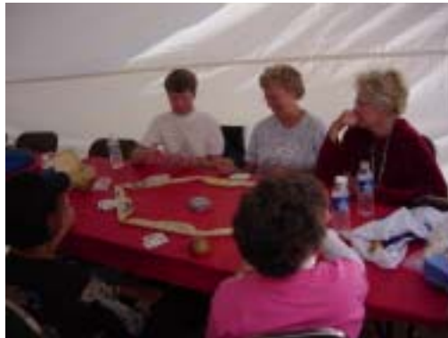
Playing Jokers and Marbles