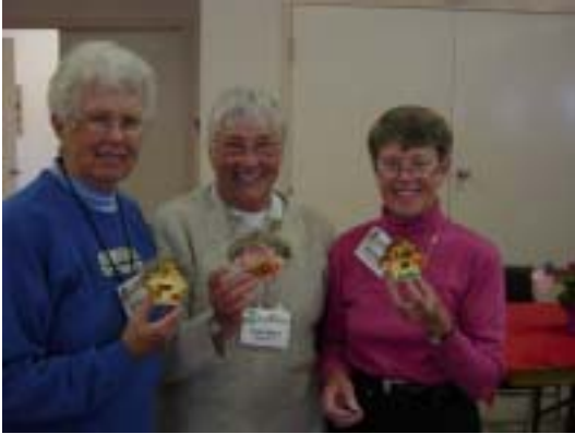
Showing Off Birdhouses