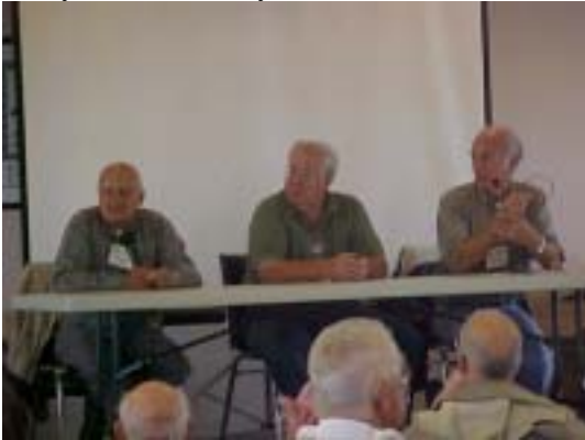
Experts Panel #1 JL