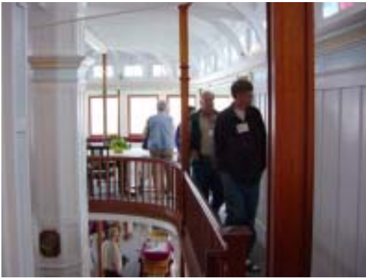
Touring the SS Sicamous