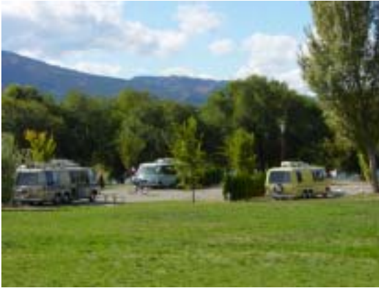
Campground Scenery #1