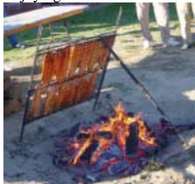
Salmon on the Grill