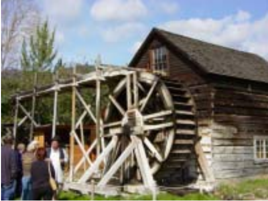
The Keremeos Gristmill