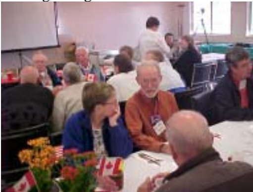
Pre Dinner Conversations JL