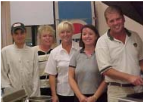
Our Caterers from The Ridge JL