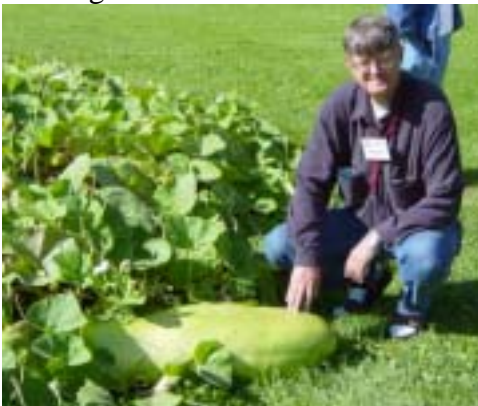
A Melon That's Really a Gourd