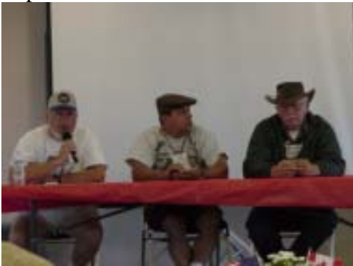
Experts Panel #2