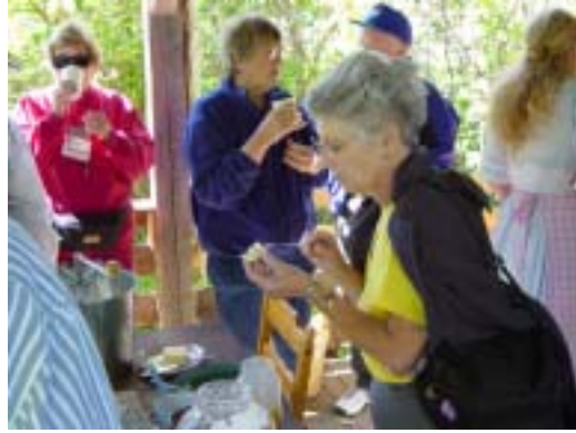
Sampling Bannock and Tea