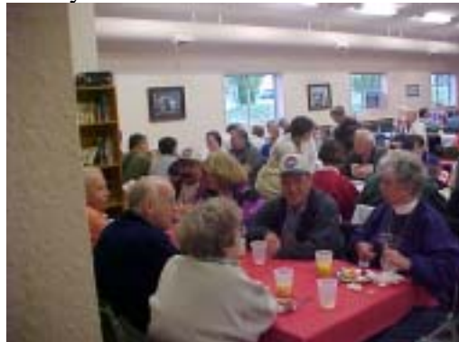
Enjoying our Breakfast JL