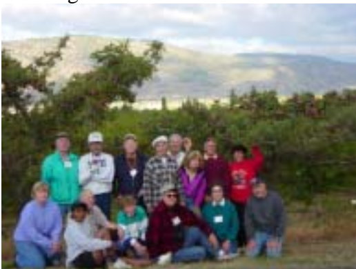
Walkers in the Apple Orchard