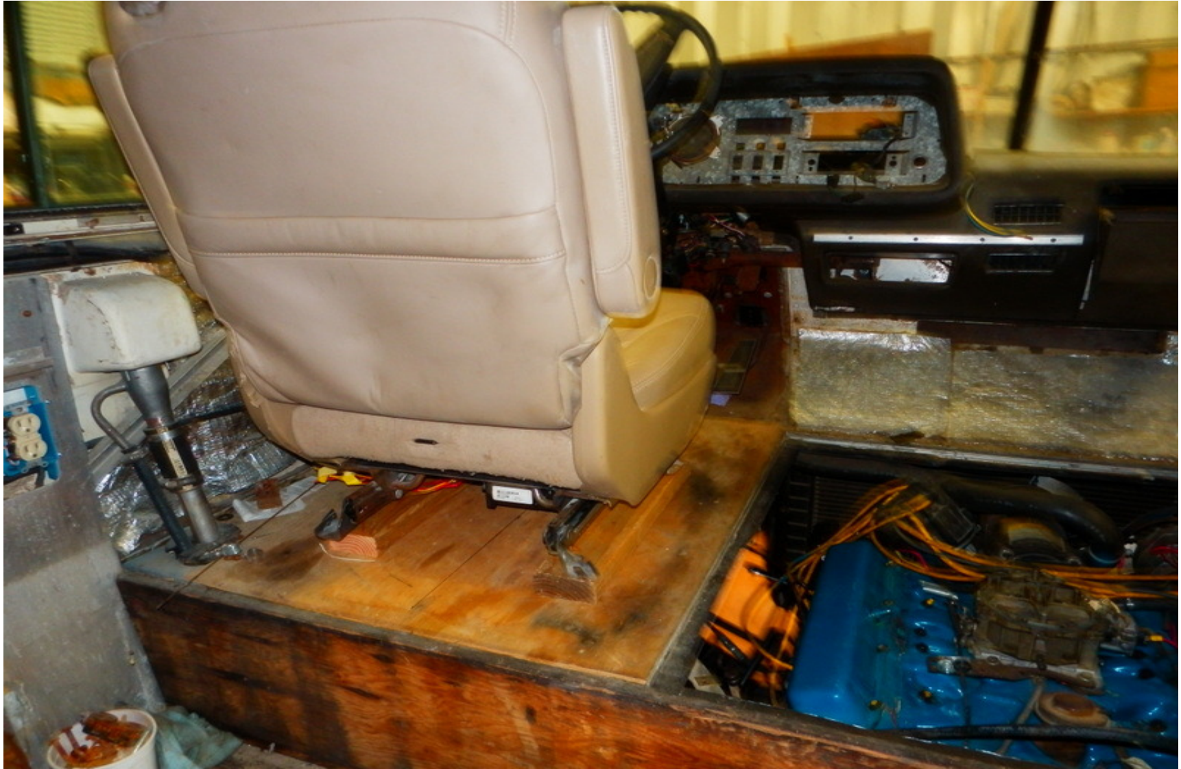
HONDA SEATS, LINCOLN POWER SEAT BASE