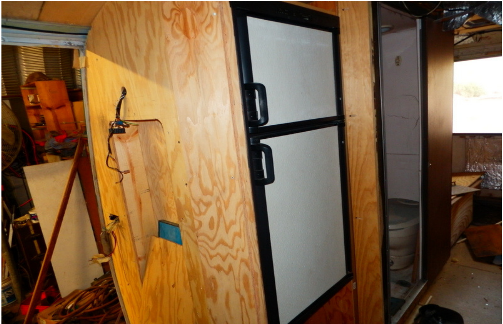
DOMETIC 2 WAY