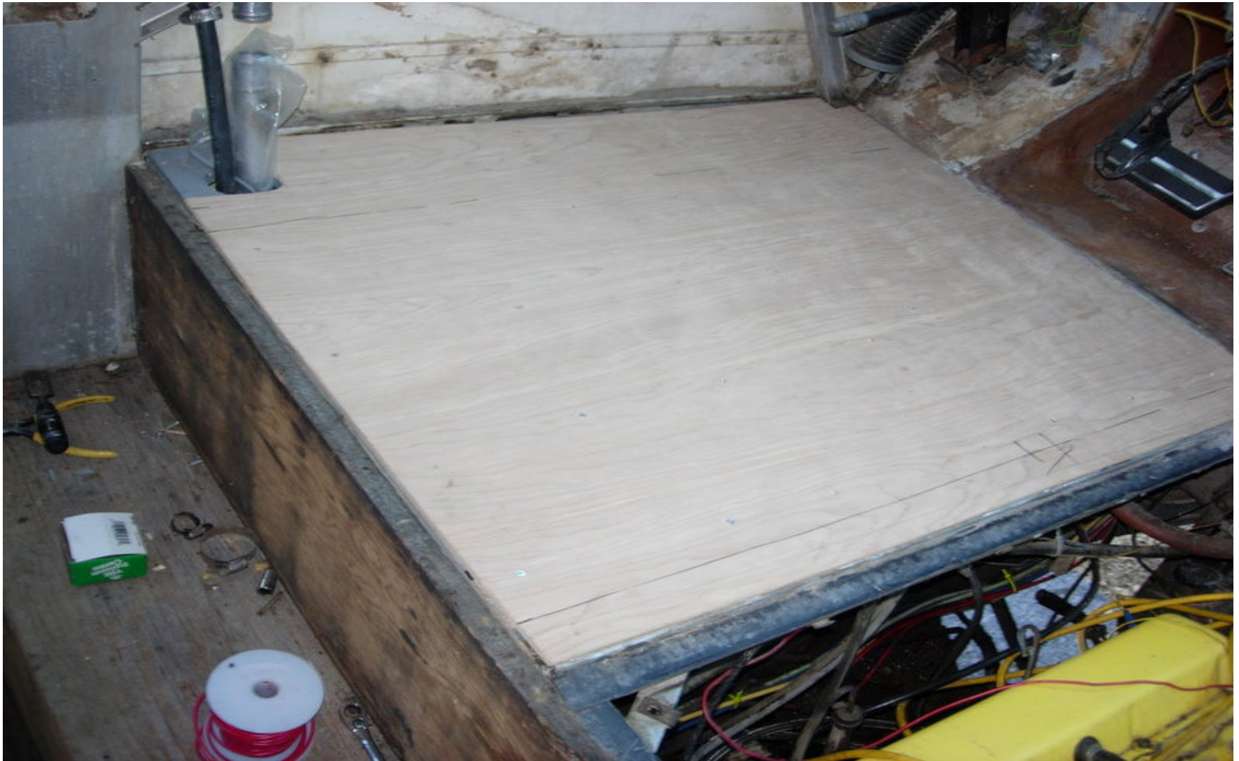
FINAL LAYER, ¼" BONDED WITH URATHANE