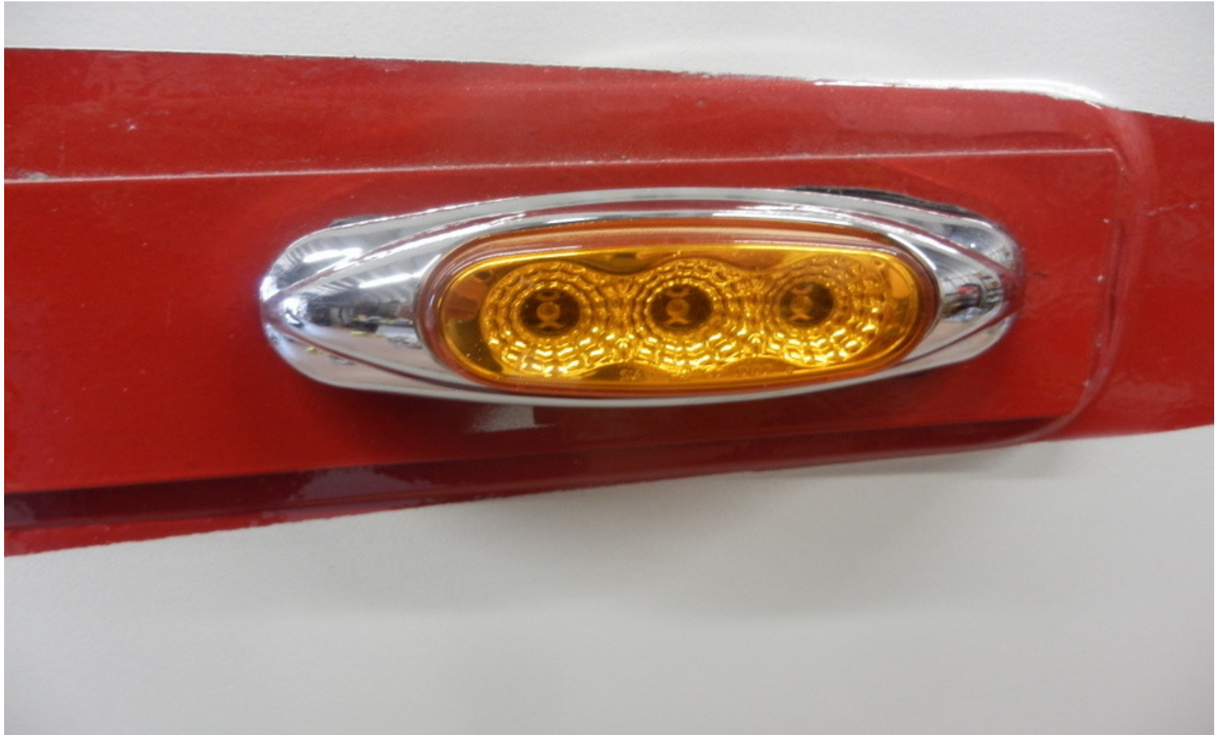
ZIPPY SIDE LIGHTS