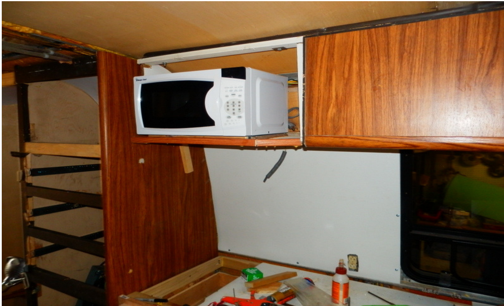
MICROWAVE INSTALL FULL EXTN. DRAWER SLIDES