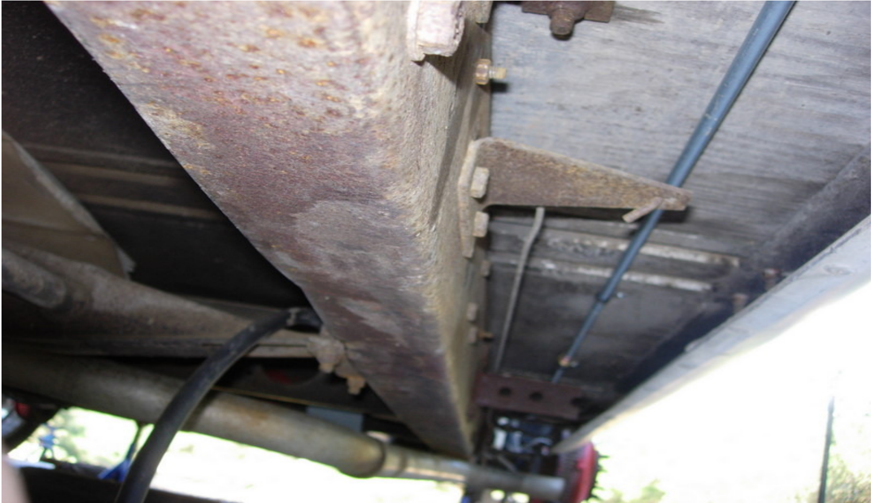
FUEL LINE OUTSIDE FRAME