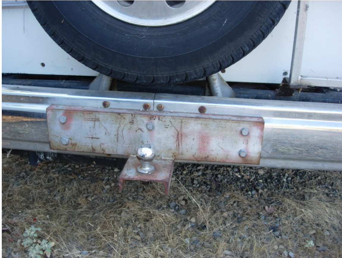
THE ORIGINAL THROUGH THE BUMPER HITCH