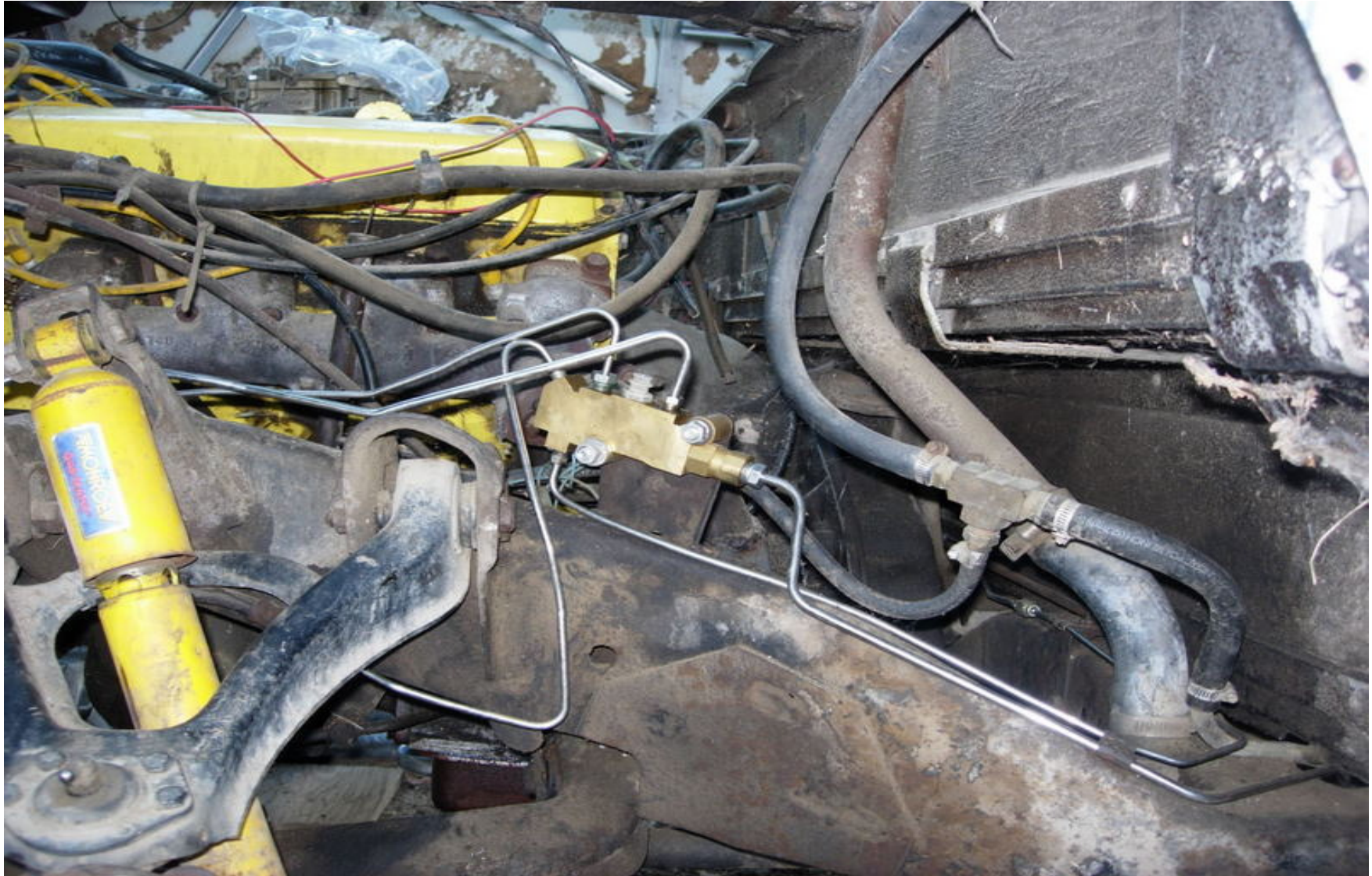
SS BRAKE LINES