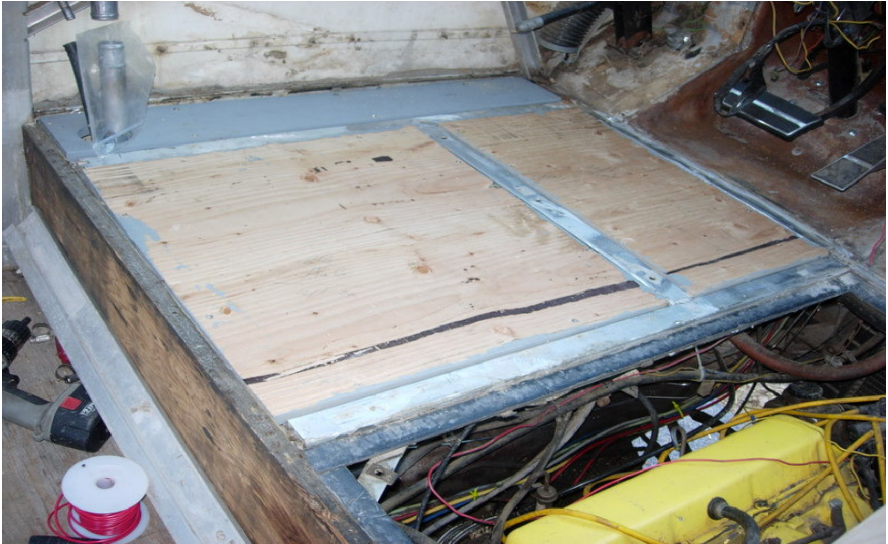
FIRST LAYER \frac{3}{4} CDX