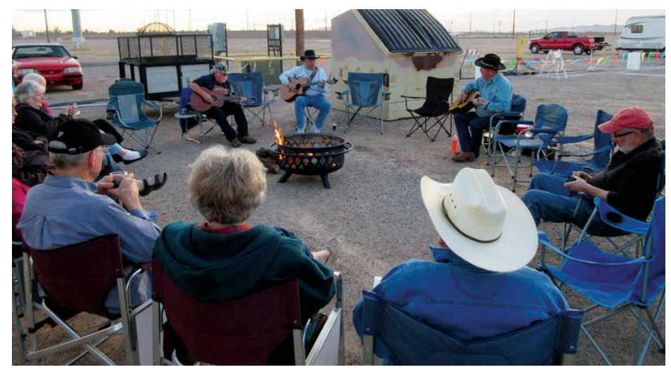
Saguaro Jetsetters at Bluegrass Rally