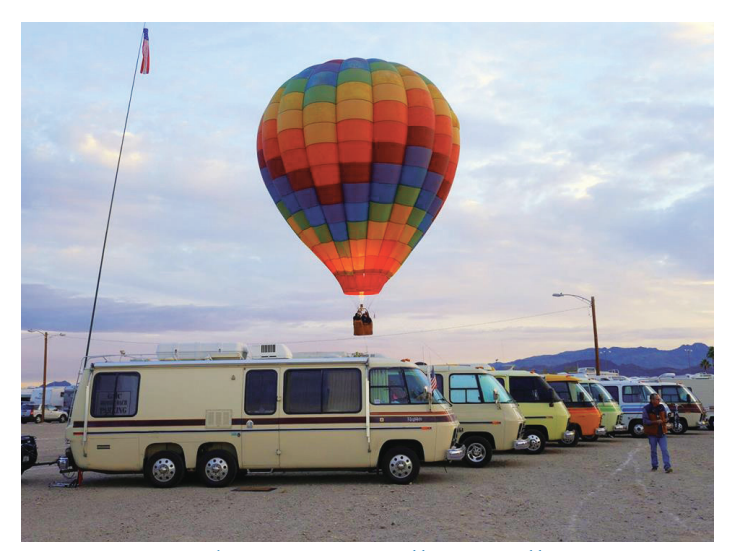
Lake Havasu Balloon Rally 49ers and Pacific Cruisers