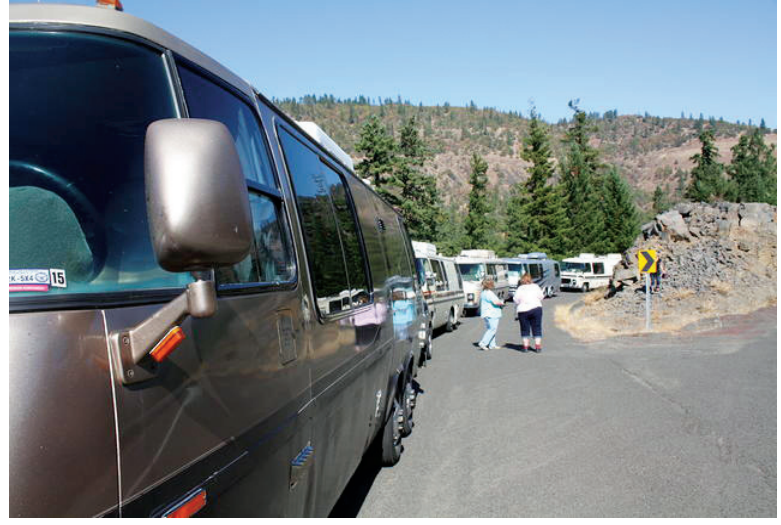
Cascaders Rolling Rally